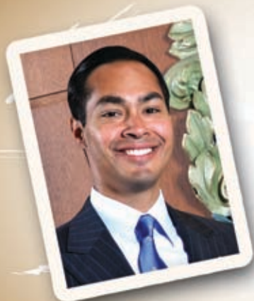
Grand Marshal - City of San Antonio Mayor Julián Castro

Bring your own chairs or come early to stake out limited FREE parade seats. Parade Step-off at Guadalupe & Brazos Route continues to Zarzamora stopping at Westside Professional Bldg.